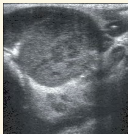
Figure 1. Ultrasound image of the spleen of a ferret with multifocal nodular hyper-echoic and hypoechoic regions, showing infiltrative disease eventually diagnosed as lymphoma.

However, because these findings may be caused by a variety of diseases, additional diagnostic sampling is indicated. While radiographs are necessary, they should be considered screening or supportive tests.